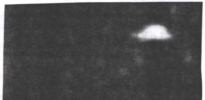
A frame of Escamilla's tape shows a fuzzy, silver disk-shaped object.

Escamilla is tapping his feet and pulling at his cap. He slows the tape and runs it frame by frame. What looked like a blob now looks like a silver disc. It shoots through the frame in approximately 1/30th of a second. "Could be birds. Could be a plane," Escamilla says. "But I don't think so. This stuff is hauling way too fast."